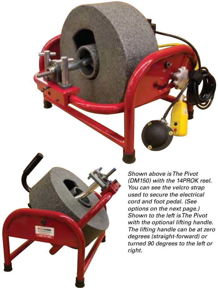
Shown above is The Pivot (DM150) with the 14PROK reel. You can see the velcro strap used to secure the electrical cord and foot pedal. (See options on the next page.) Shown to the left is The Pivot with the optional lifting handle. The lifting handle can be at zero degrees (straight-forward) or turned 90 degrees to the left or right.

The Pivot's standard package (part number DM150A) comes with the following: revolving arm, 1/3 HP motor at 230 rpm, 14" enclosed polyethylene reel, oversized, with head bearing, 1/2" x 4' tail piece, 1/2" x 75' cable, and choice of end fittings.