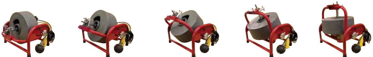
Pictured below is The Pivot (Model DM150) shown in each of the five notched positions.