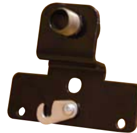
The standard quick-lock guide tube bracket is shown above, part number 11036.