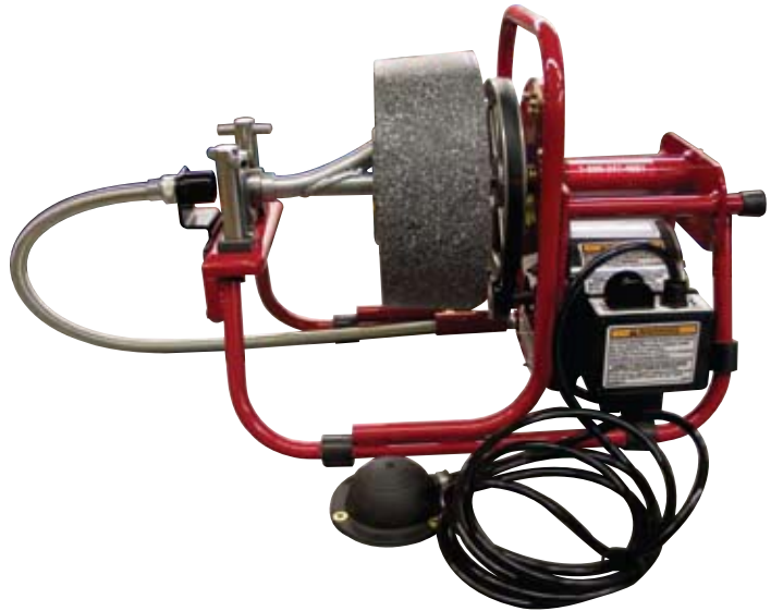
The Earl (DM125) machine is shown above with the 8PRK reel and guide tube and quick-lock guide tube bracket. (See options on the next page.)

The Earl's standard package (part number DM125A) comes with the following items: revolving arm, 1/6 HP motor at 230 rpm, 8" enclosed polyethylene reel, 1/4" x 37' cable, guide tube, and quick-lock guide tube bracket. See the machine packages and accessories charts on the next page for additional options.